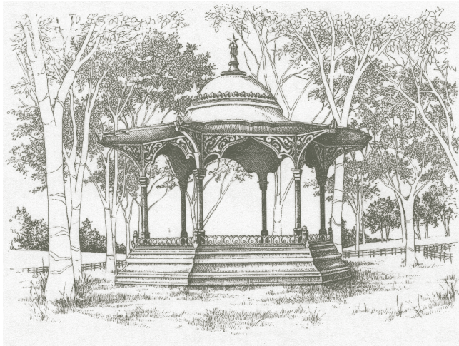
From a Tiffany & Co. card © 1995