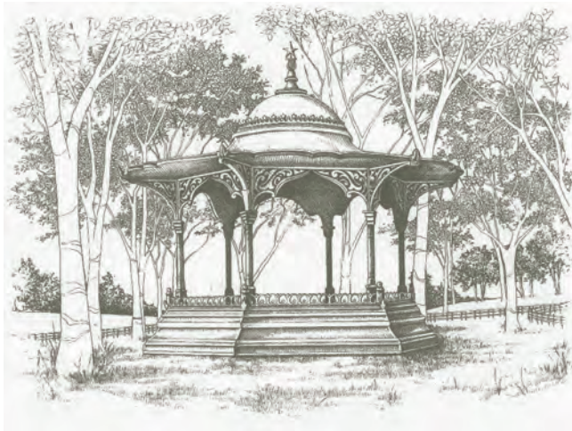
From a Tiffany & Co. card © 1995