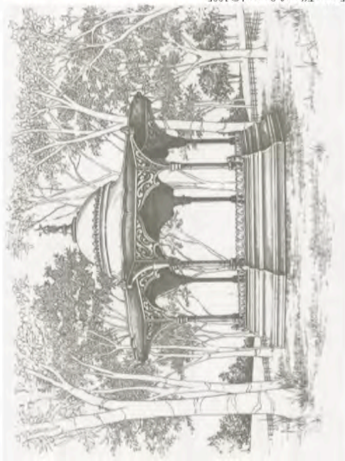
From a Tiffany & Co. card © 1995

In 1859 Jacob Wrey Mould, an amateur musician and the architect who designed many of the original structures in Central Park, persuaded his wealthy friends to pay for free band concerts at a temporary bandstand in the Ramble, and he arranged their musical programs. The first concert, on July 13, included the Festival March from Tannhäuser , Mendelssohn's song, "I would that my Love," selections from La Traviata and Strauss's Sorgenbrecher Waltz . In the summer of 1860 concerts were transferred to the Mall, and The New York Herald reported that the September 22 concert attracted "at least five thousand persons gathered around the performers, while outside of these were stationed an immense number of carriages... filled with the beauty and fashion of New York." The overwhelming popularity of the concerts prompted Central Park's board to finance them and to build a permanent Music Pavillion on the west side of the Mall near the Terrace. Mould designed the elaborately painted and brightly gilded Moorish-style wooden and cast-iron structure, completed in 1862. The Parks Department razed the Music Pavilion in 1923.